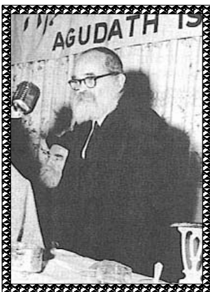
R' Yaakov zt"l speaking at an Agudah Dinner

HaRav Yaakov Kamenetzky zt"l answers this question based on another question. Why was it necessary for the pasuk to mention the fact that Bnei Yisroel was dancing when Moshe arrived? Ostensibly, what angered Moshe was the creation of the eigel ; as such, the mention of the dancing seems to be somewhat superfluous. Rav